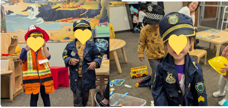
Community Helpers: Photos from February